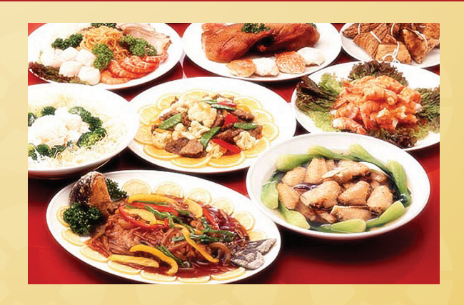
Taste of Asia 5 p.m. - 6 p.m. First United Methodist Church 145 S. Prairie St.