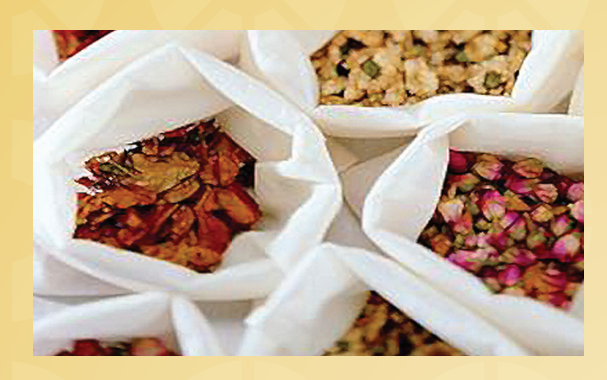
A display of Asian herbs, medicine and currencies Reception, April 9 | 3:45 p.m. - 5 p.m. Center of the Arts Atrium