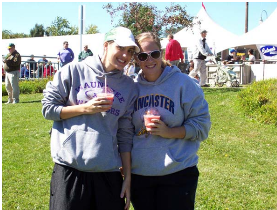
UWW Student Optimists join the fun.