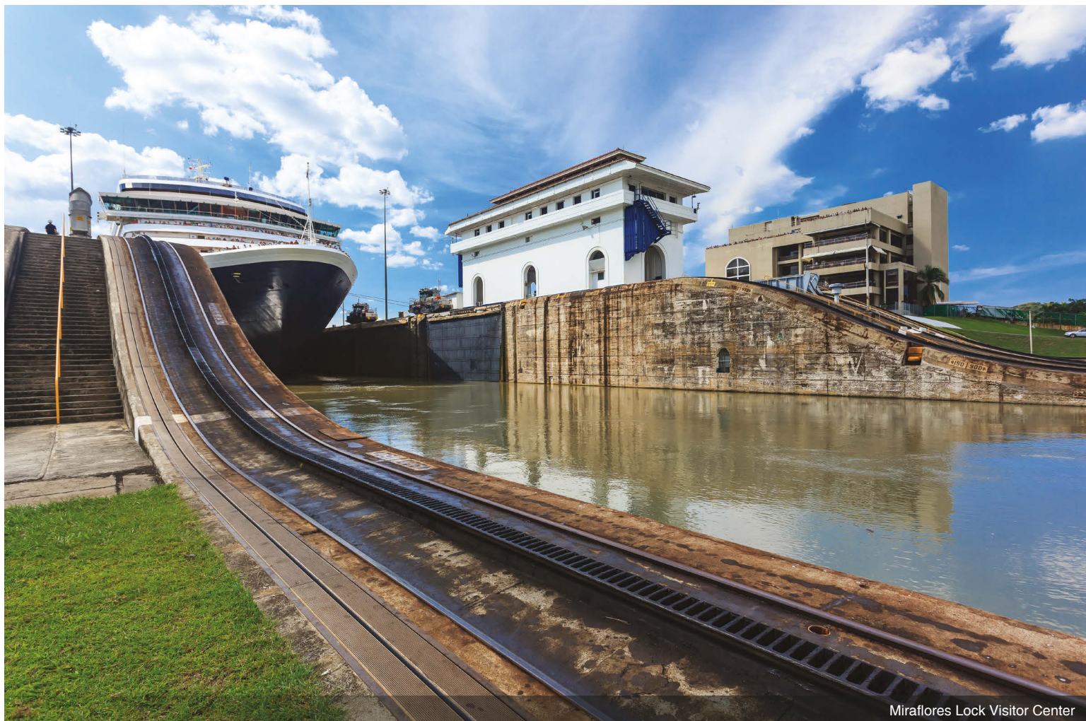
Miraflores Lock Visitor Center