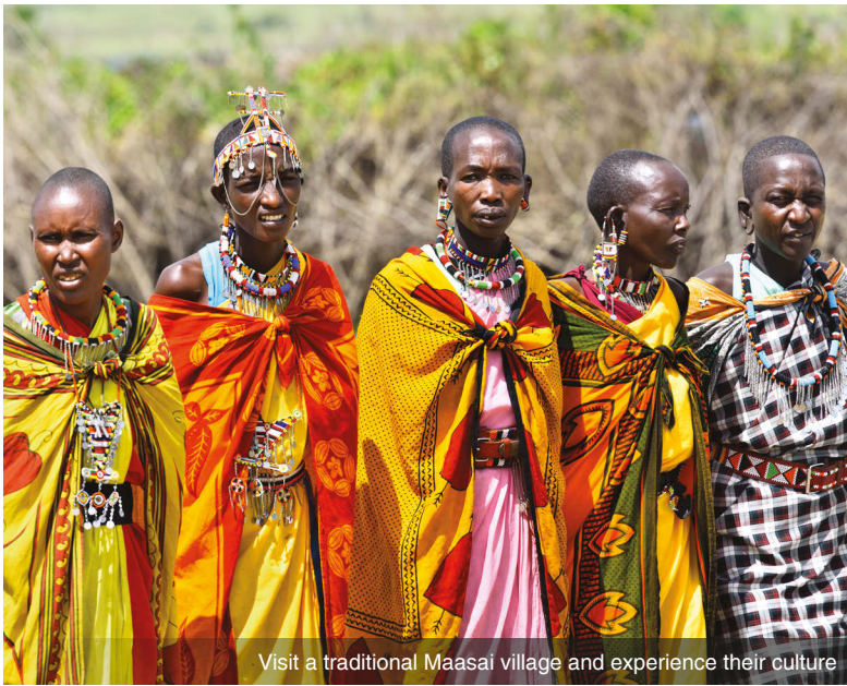
Visit a traditional Maasai village and experience their culture

Rift Valley. Relish in the surrounding sights and sounds of the native wildlife. Beautiful birds along the banks, in the trees, and soaring above; lazy hippos yawning as they emerge from the water; African Fish Eagles swoop down to snatch a fish from the lake for dinner...it all awaits! Check in to the lodge and enjoy a relaxing evening. Meals: B, L, D