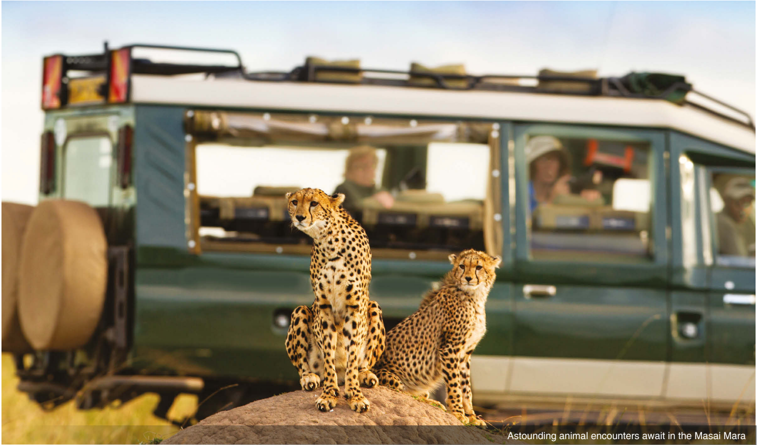
Astounding animal encounters await in the Masai Mara