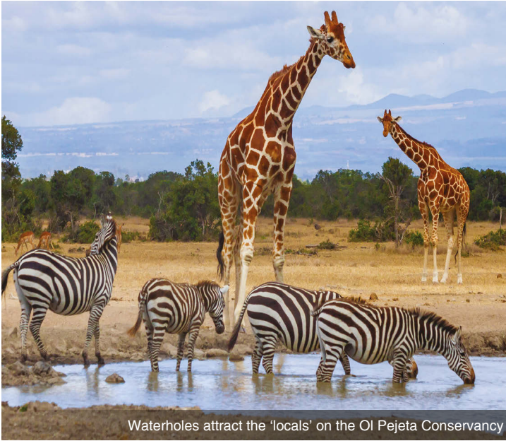
Waterholes attract the 'locals' on the OI Pejeta Conservancy