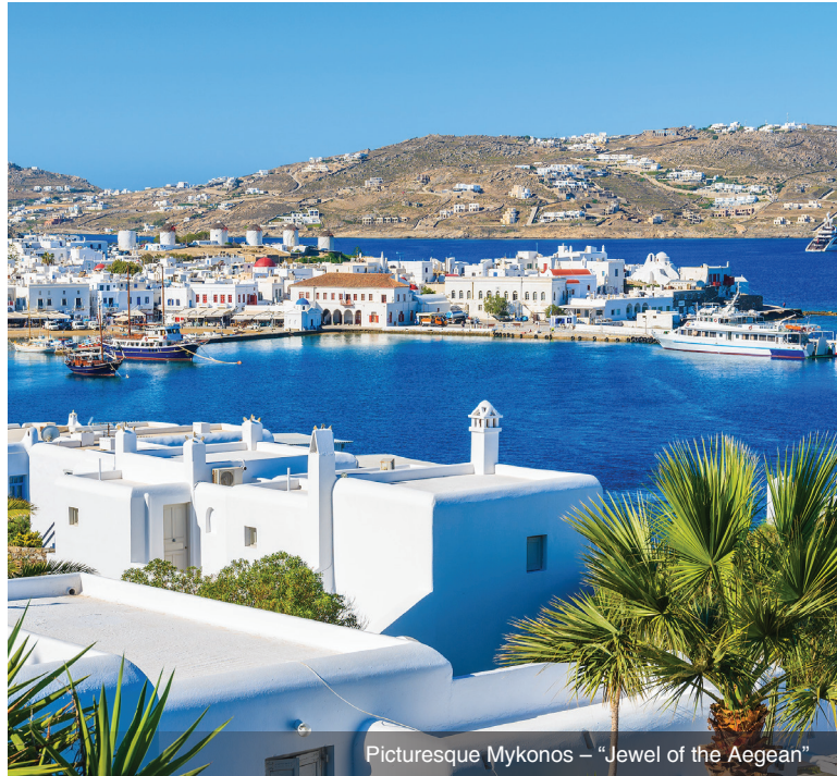
Picturesque Mykonos – "Jewel of the Aegean"

During the panoramic portion of the tour, see the historic ruins of the Temple of Zeus and Hadrian's Gate. While passing Constitution (Syntagma) Square, see the Parliament Building and Tomb of the Unknown Soldier, guarded by Evzones - soldiers in traditional FoustANELLA attire.