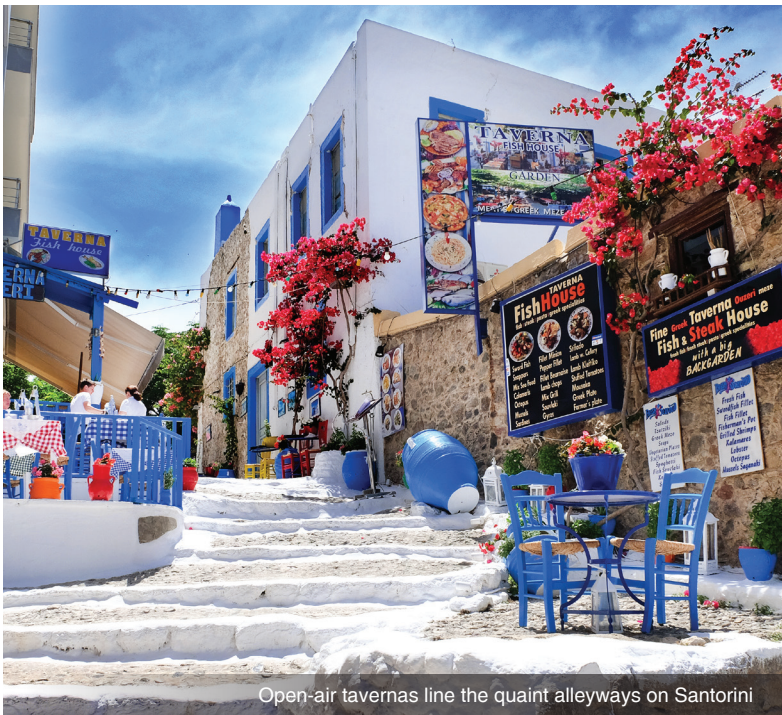
Open-air tavernas line the quaint alleyways on Santorini

remainder of the day at leisure. Browse in the boutiques, visit the beach or simply enjoy people-watching and meeting the locals at a sidewalk café. Meal: B