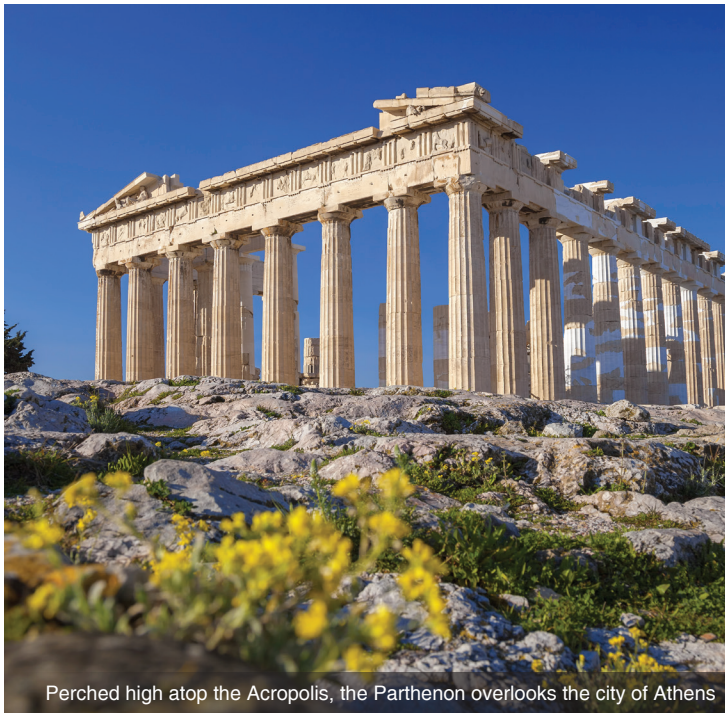
Perched high atop the Acropolis, the Parthenon overlooks the city of Athens

DAY 1 Depart the USA: Depart the USA on your overnight flight to Athens, Greece, a city with a history that dates back almost four millennia.