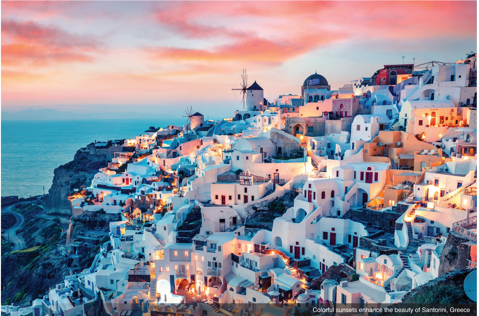
Colorful sunsets enhance the beauty of Santorini, Greece