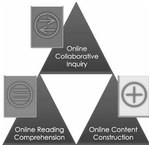
Fig. 1. Online Research and Media Skills Model

Online reading comprehension (Leu et al., 2009) is the actual reading of online information as a process of problem-based inquiry that takes place as students use the Internet to search and sift for answers to problems. This cornerstone is viewed as reading of online information. Online collaborative inquiry is the collaboration and co-construction of a body of information by a group of local, or global connected learners. This cornerstone is viewed as collaboration by learners as they search, sift, and synthesize online informational text. Online content construction (O'Byrne, 2013) is the skills, strategies, and dispositions necessary as students construct, redesign, or re-invent online texts by actively encoding and decoding meaning through the use of digital texts and tools. Content construction is viewed as including the process and product of writing using digital texts and tools.