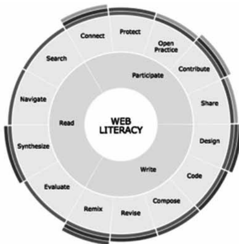
Fig. 3. Web Literacy Framework Version 2.0