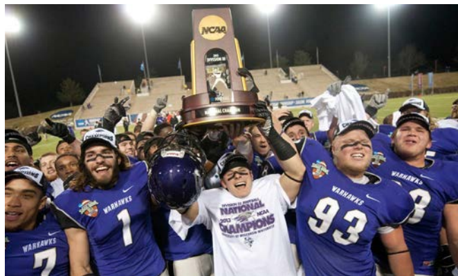
In 2014 UW-Whitwater became the first school in NCAA history to win the trifecta – National Championships in football, mens basketball and baseball in one year.

The Warhawk Athletics Strategic Priority Fund will allow the Director of Athletics to best focus resources on projects that will maximize the student-athlete experience and benefit the overall health and competitiveness of individual sport programs. Warhawk Athletics is Powered by Tradition and driven by the coaches and alumni who tirelessly worked and continue to work to achieve a hard-earned reputation for excellence. With you, new tradition in Athletics can begin.