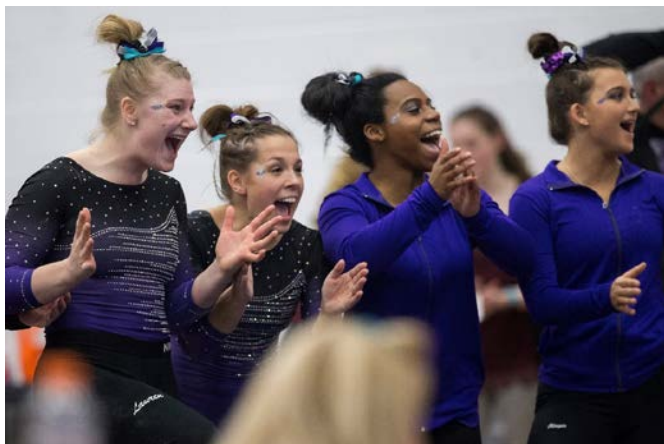
In 2018 the Women's Gymnastics team won the NCGA National Championship for the second straight season and fifth time in program history.

The University of Wisconsin-Whitewater is a premier comprehensive institution, and Warhawk Athletics is committed to providing our more than 700 student-athletes with a first-class experience academically, athletically and socially. The Department of Intercollegiate Athletics is dedicated to UW-Whitewater's institutional mission and we seek to contribute to the university's overall success. That means competing on a national stage and winning championships.