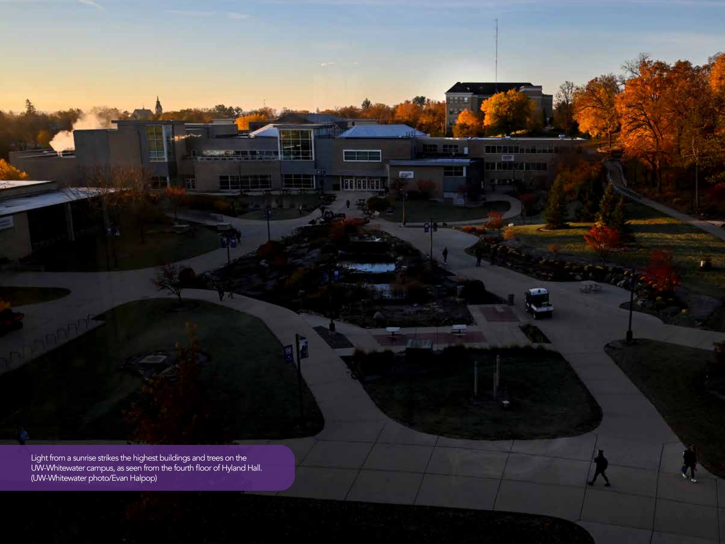
Light from a sunrise strikes the highest buildings and trees on the UW-Whitewater campus, as seen from the fourth floor of Hyland Hall.