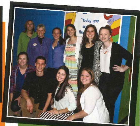
[ "Hallway Beautification Project" completion at Lincoln Inquiry Charter School (LINCS). ]

Some of the proceeds from the first "Optimist Trivia Night" were used for shipping an ambulance to Burkina Faso, Africa. In an eight-month period after the ambulance was delivered more than 400 patients were served by the emergency vehicle. The Student Club has coordinated nine service-learning trips over the past 14 years, including to Jamaica; Bay St. Louis, Mississippi; Belize; Ecuador; Milwaukee, Wisconsin; and Burkina Faso.