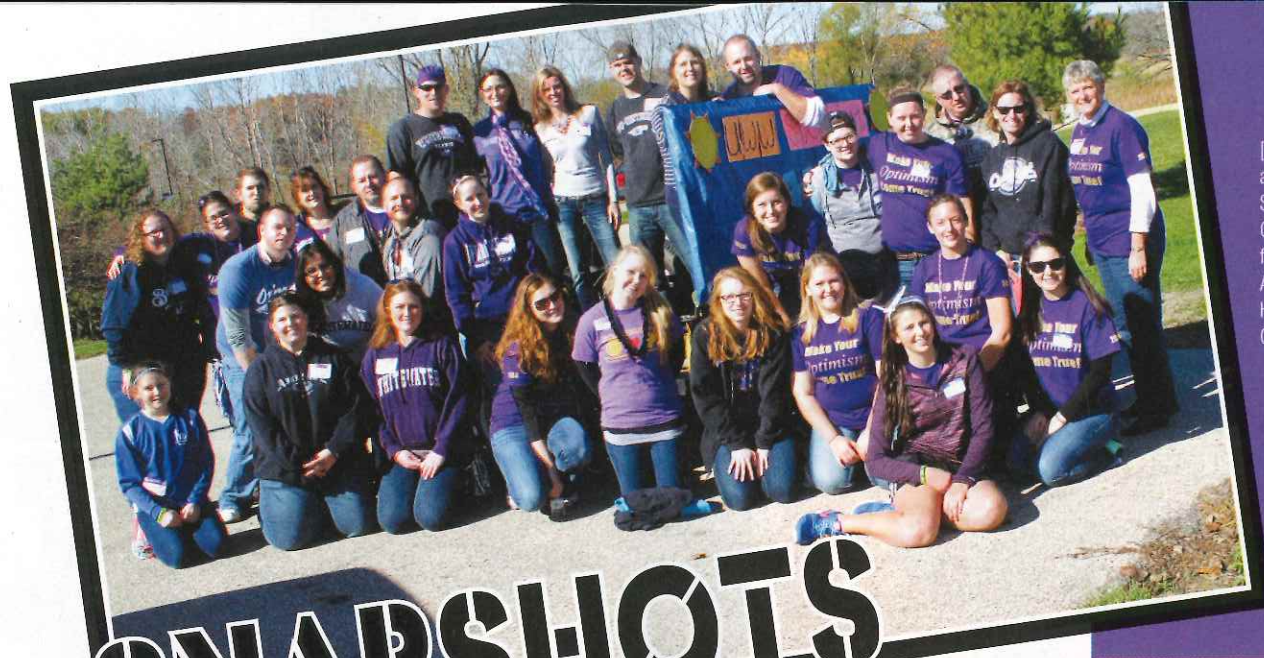
[ Current Members and UW-Whitwater Student Optimist Club alumni gathered for the Club's 20th Anniversary at Homecoming in October 2014. ]